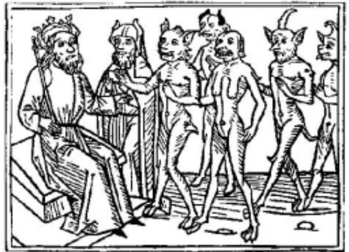
The demon Belial appearing with his entourage of four lesser demons before King Solomon. From Jacobus de Teramo's Das Buch Belial, printed at Augsburg 1473.

Ph:(306)763-3952 ravenson@sk.sympatico.ca