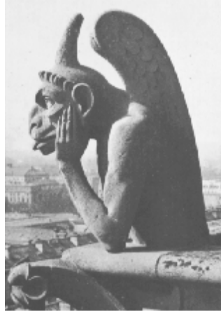
A 'thinking' grotesque on the Cathedral of Notre Dame

Contrary to what many people may think a gargoyle is not necessarily a gargoyle. We have all seen (or at least seen pictures) of funny looking critters carved from stone on the sides of old buildings. We tend to call all of these things gargoyles which is not quite correct. You see a true gargoyle, with its name taken from the French word "gargouille" which means throat or pipe, functions as a rain spout. An odd shaped beastie which does not maintain this functionality is properly called a grotesque.