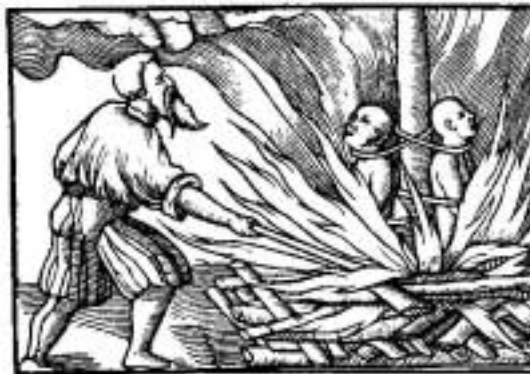
From the Histoire veritable de quatre lacopins, Geneva, 1549.

To make reservations, ask questions, request crash space (a very limited number of hotel rooms may be available at a reduced rate), etc contact Their Excellencies Myrgan Wood: Raoul &/or Roxanne 306.651.2599 or duane.walker@sk.sympatico.ca