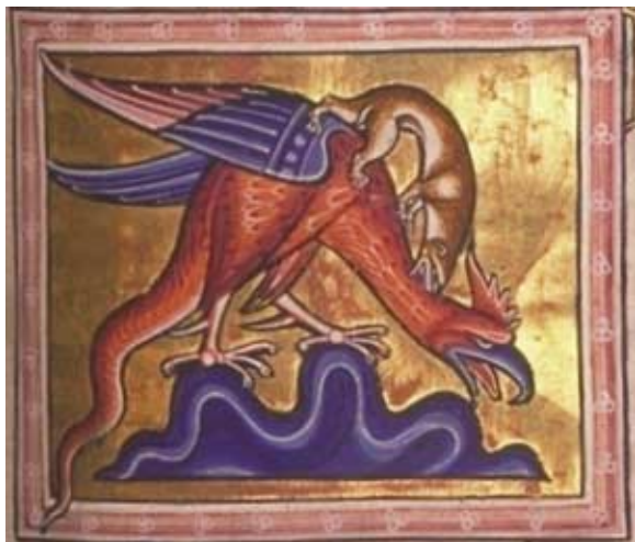
A basilisk being attacked by a weasel.

Basilisks, like scorpions, seek out dry places; after they have come to water and bite anyone there, they make that person hydrophobic and send them mad. The creature called sibilus is the same as the regulus , or basilisk; for it kills with its hiss before it bites or burns.