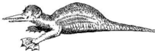
Ye tired and demented beast known as the Chronicler: Fear his rambling editorial and abysmal sense of humour.