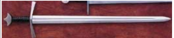
A typical cut and thrust sword, primarily used for chopping cuts.

A drawing cut is when the blade of the sword is drawn across whoever or whatever is meant to be cut. It does not rely on momentum alone and will cut deeper and deeper as the blade is drawn across that which is to be cut. Drawing cuts can cut very deeply, and against an opponent with little or no armour, they would likely be the most effective. The difficulty arises in the fact that a drawing cut is not very effective against an armoured opponent, as the blade cannot easily cut through armour as it is drawn across it and will lack the momentum to shear through it. A typical drawing blade is single edged and has a curving blade so that as a warrior follows through with his arms, the blade is continually drawn across its target in an arc, cutting deeper and deeper. A Japanese katana is drawing type blade.