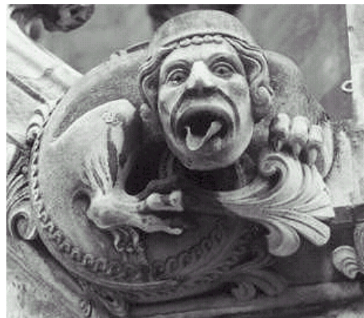
A gargoyle on Westminster Abbey.

The second reason given for their bizarre appearance of is the belief that frightening figures could scare away evil spirits. As such, the stone figures may have been thought to keep the malign spirits and ghosts out of what was to be the house of God.