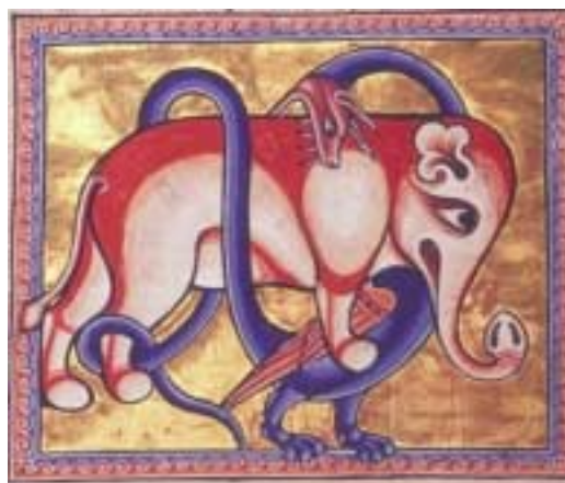
A Dragon Strangling an Elephant.

The Devil is like the dragon; he is the most monstrous serpent of all; he is often aroused from his cave and causes the air to shine because, emerging from the depths, he transforms himself into the angel of light and deceives the foolish with hopes of vainglory and worldly pleasure. The dragon is said to be crested, as the Devil wears the crown of the king of pride. The dragon's strength lies not in its teeth but its tail, as the Devil, deprived of his strength, deceives with lies those whom he draws to him. The dragon lurks around paths along which elephants pass, as the Devil entangles with the knots of sin the way of those bound for heaven and, like the dragon, kills them by suffocation; because anyone who dies fettered in the chains of his offences is condemned without doubt to hell.