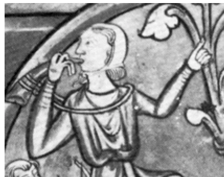
A fellow wearing a coif.

Basically a close fitting piece of cloth covering the head (including the ears usually) and fastened underneath the chin, a coif was worn on its own or underneath another hat. It was most commonly worn from the 12 th to the 13 th century.