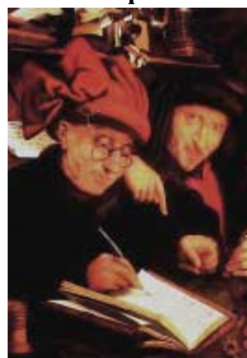
A man with a Chaperon

A more descriptive name for this might be a dead chicken hat. A chaperon is basically a hood worn in an odd fashion. Imagine putting the face hole of a hood on your head, holding the shoulder cape up, and wrapping the tippet around your head like a band. Ta-da! You have a Chaperon. The later the period the more modified the 'hood'.