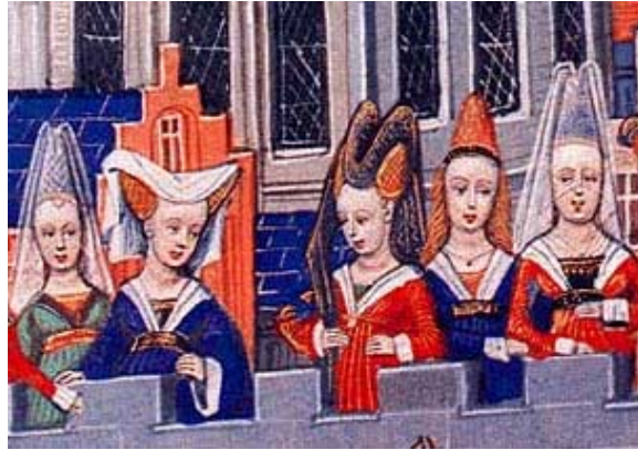
A group of ladies wearing hennins.

Basically a rigid pair of 'horns' or a cone draped with a veil like fabric, hennins became an illustration of social standing. They were worn by women exclusively and were mainly a 15 th century phenomena.