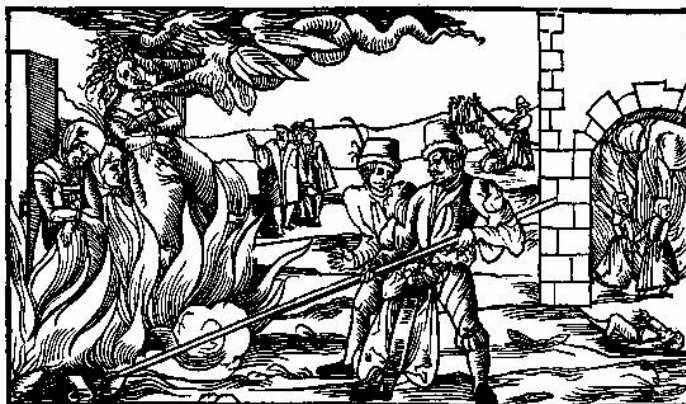
Note the witches and the burners all have hats...