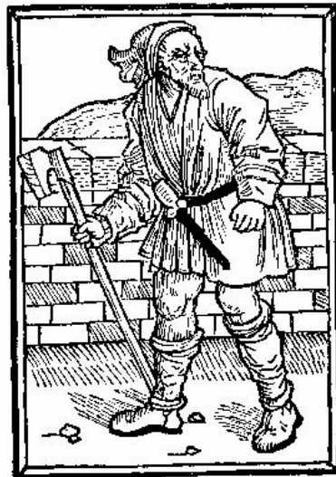
A Countryman - 1489

-every Wednesday at 7pm, at City Park Collegiate