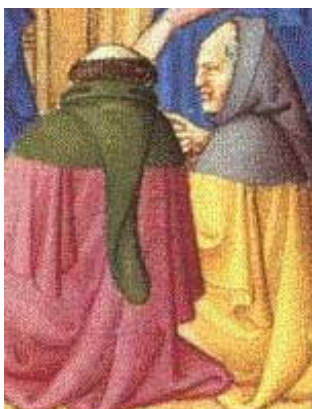
Two men wearing hoods.

Hoods are, well, hoods! Consisting of a face opening, shoulder cape and often a tail, which was called a tippet or liripipe, hoods are a nice warm hat for cold days/events. A longer tippet can even be used as a scarf of sorts when it is cold out. Variations on the hood are basically tippet length, shoulder cape length, throat opening, and embellishment on the cape edge. Hoods were the most fashionable in the 14 th Century.