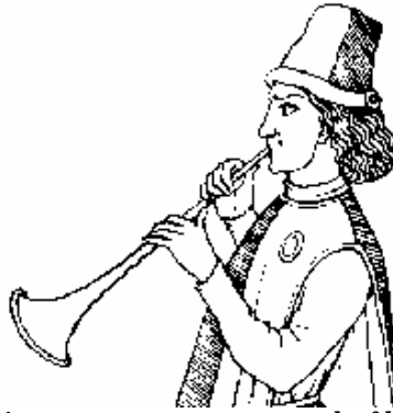
A musician wearing a sugar loaf hat.

Sugar Loaf hats are tapered narrower at the top and elongated upwards like a sugar loaf, hence the name. They could be either stiff or soft and could be pleated. Quite similar to the Phrygian hat, only more upright.