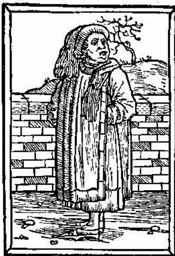
A townsman - 1489

On behalf of the Barony I thank you - again and still for the work that you do.