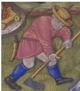
A farmer with a straw hat in a 15 th Century Illustration

A simple, cheap, and functional piece of headgear, the straw hat fits virtually all periods and regions, though were not really known for their place in high fashion. There is another picture of a straw hat on the cover of this issue of the King's Garb.