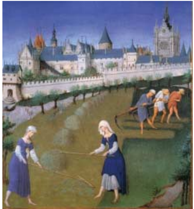
Les très riches heures du Duc de Berry: June, by the Limbourg brothers, 1412-16