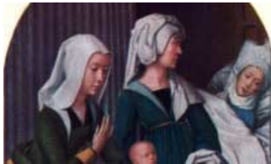
Here a group of ladies wear wimples.

Basically just a square of cotton or linen worn with or without a throat piece, or gorget, wimples were another hat for women. They were valued as a symbol for modesty and like the hennin, were women's hats.