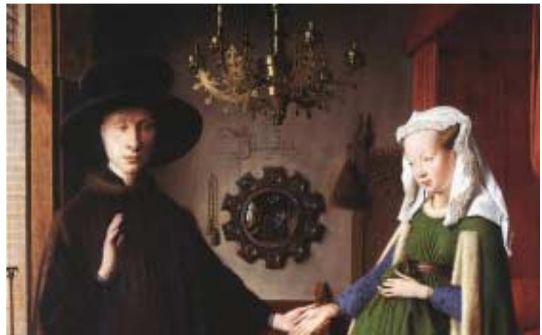
The Arnolfini Wedding by Jan van Eyck, 1434

Ph:(306)763-3952 ravenson@sk.sympatico.ca