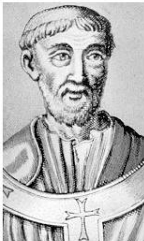
Pope Urban II – the man who started all the fuss.

From the Baron and Baroness of Myrgan Wood