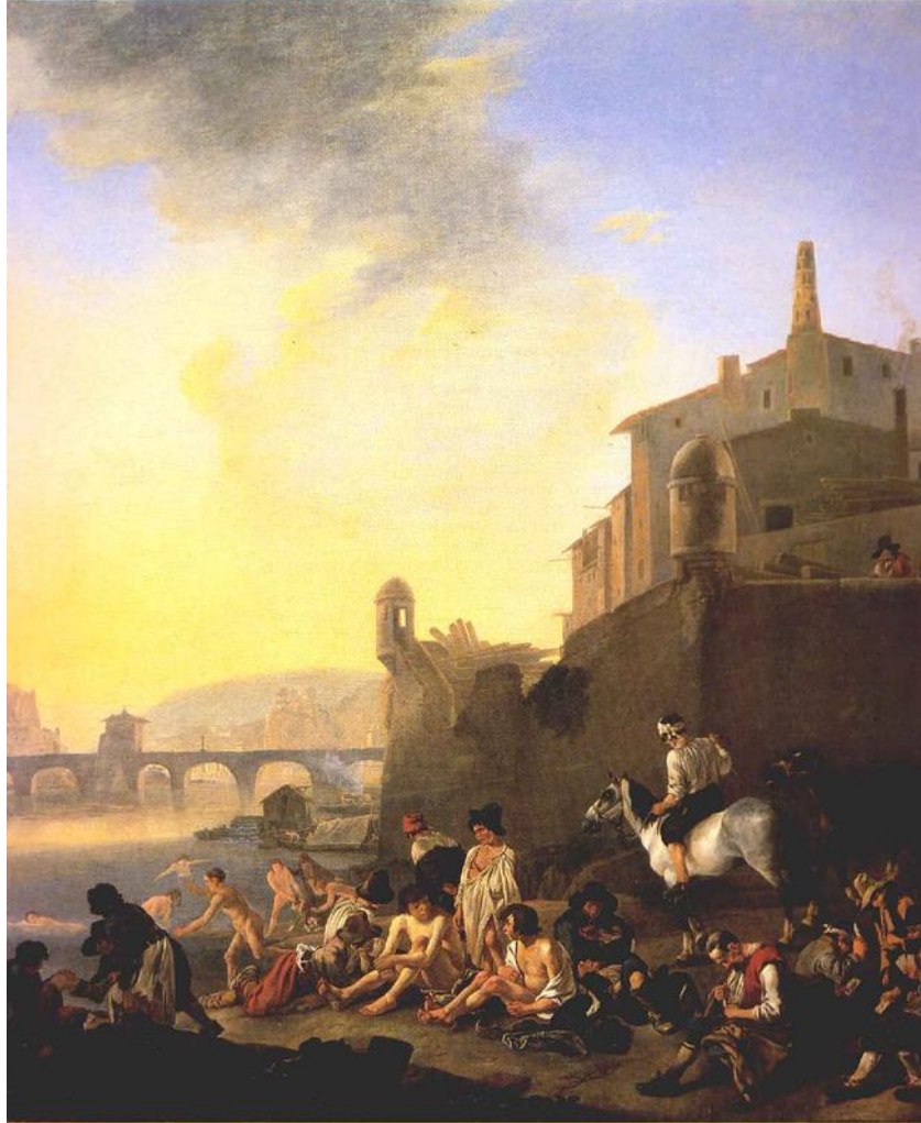
Bathing gypsies, by Johannes Lingelbach. I dunno why spring makes me think of gypsies, but it does, so there you go.

Spring Champions Promo Issue April 2005 (AS XXXIX)