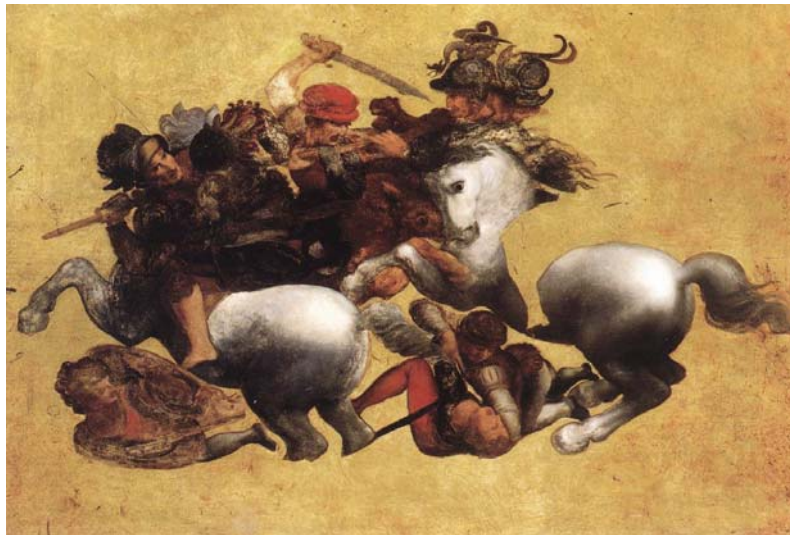
Two distinct details of The Battle of Anghiari , Leonardo da Vinci (in honour of upcoming war season).

Psych! It's actually spring now! May 2005 (AS XL)